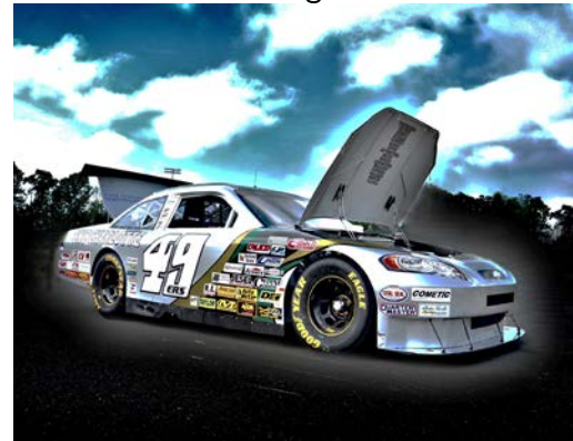
UNC Charlotte Car of Tomorrow (06/2013)